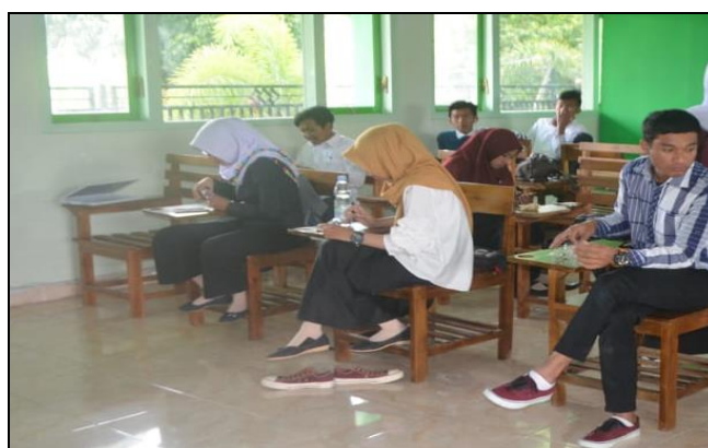
Figure 2. Students make preparation for learning outcomes

The results of the observation analysis of student learning activities in cycle II at meeting I were: paying attention to the lecturer explanation 84.4%; eager to receive 85.4% learning; workout 72.9%; solve