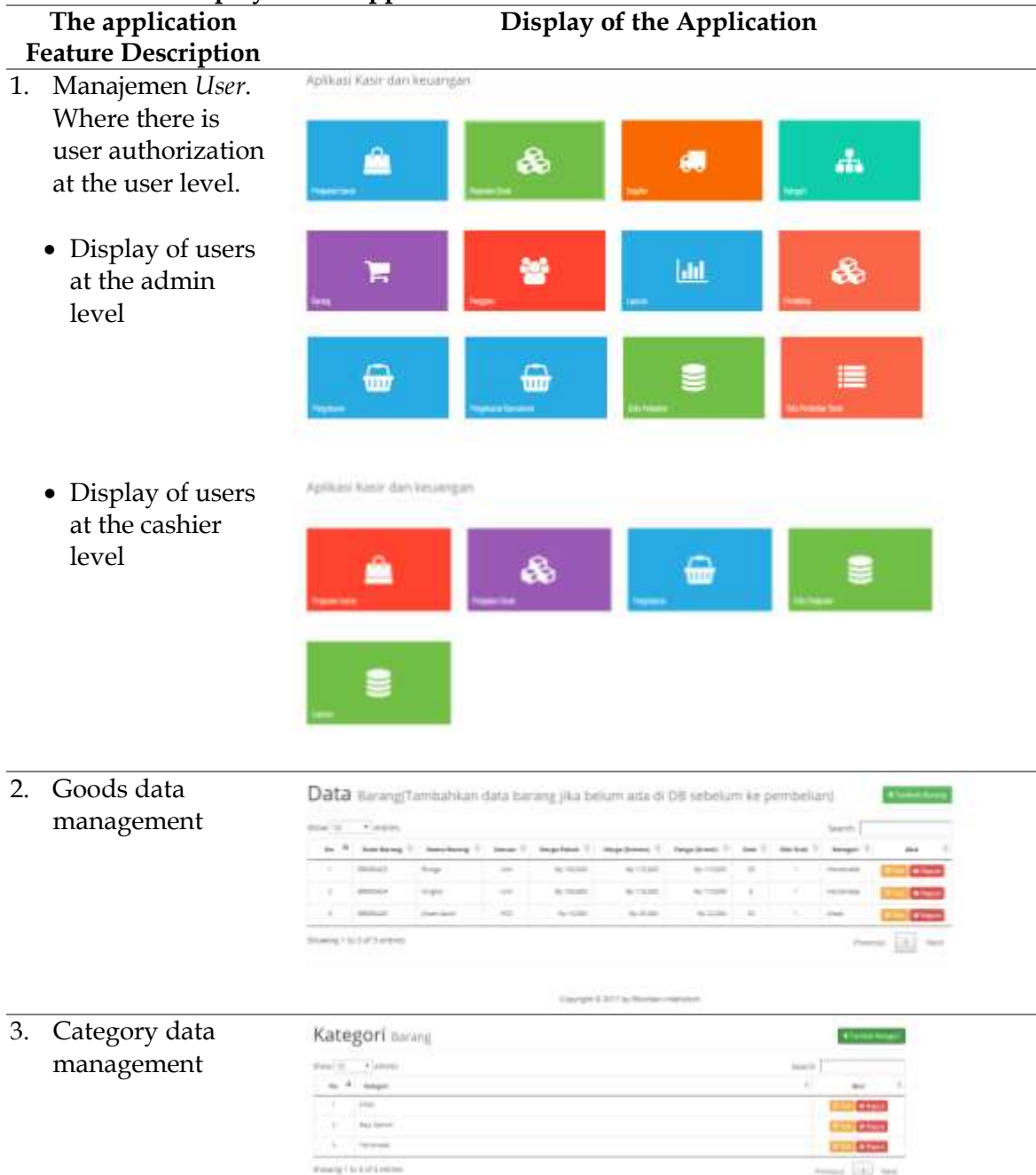
Table 1. The Display of the Application

external parties in this case financial institutions to provide financial reports that are used as conditions for submitting additional capital. SIA application that is implemented based on the website to make it easier for users to access applications anywhere is not pegged only on specific computers and also so that the form is lighter when processing data. Not only can it be applied to the SIA application computer, but it can also be used on a mobile phone, so it is effortless for users to connect with this application. An applicative display that can be run on a mobile phone adds value to the SIA application because the user process is very familiar to the current generation, where MSMEs do not recruit employees with accounting knowledge in financial records. After all, MSMEs are still in business on a small scale.