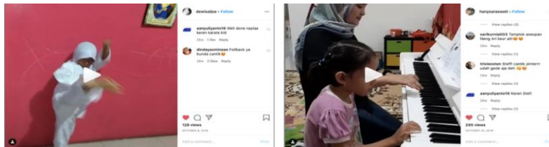
FIGURE 4. My hobby learning activities through instagram