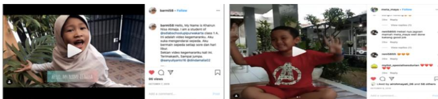
FIGURE 3. My hobby learning activities via instagram

Videos uploaded on Instagram by the accounts @barimi58 and @meta_maya show the expressions of students explaining their hobbies of cycling, swimming, and playing football. The student looks excited. In line with that user experience to obtain self-satisfaction through Instagram can be explored even deeper through the process of receiving stimulus until the onset of human behavior (Zein & Rachim, 2018). Also, students' verbal-linguistic intelligence looks very good with a complete explanation by introducing themselves and using three languages at once, namely Indonesian, Sundanese, and English. The study says through Instagram students can practice 4 skills in English at once (Sesriyani & Sukmawati, 2019). A study also said Instagram can be an effective pedagogical tool in second language acquisition if used and monitored appropriately (Shazali, Shamsudin, & Yunus, 2019). Instagram can contribute to the students' confidence to speak in a foreign language and speaking skills (Rahmah, 2018).