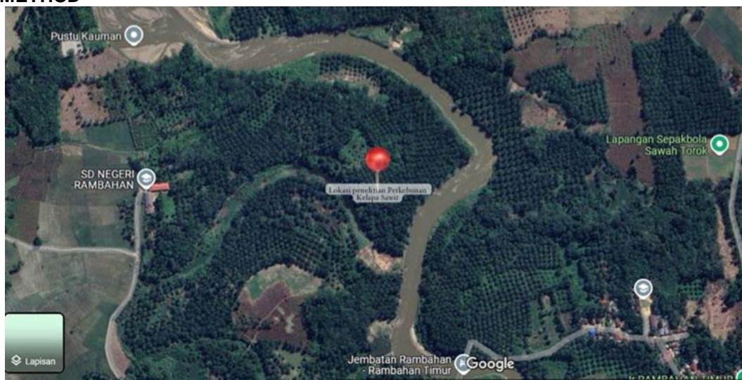
Figure 1. Map of the research location

This research uses an exploratory survey method. The exploration method is carried out by exploring the oil palm plantation by taking the road in the middle of the plantation then walking to the right and left in a zigzag manner for 20m each. This is done repeatedly until no more different species are found. During sampling activities in the field, several tools and materials are needed to load the dry herbarium of fern specimens, including scissors, cutter knife, newsprint, cellphone, duct tape, sacks, plywood, large plastic, raffia rope, label paper, and other stationery. Meanwhile, the ingredients needed for preservation are 70% alcohol or spirit liquid.