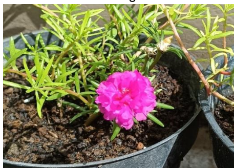
Figure 2. Purslane ( Portulaca grandiflora ) Magenta Flower Variety

Purslane herb ( Portulaca grandiflora ) extract which was formulated as an ointment test showed antibacterial activity against Staphylococcus aureus in the highest concentration (30%). This antibacterial activity may be due to the high concentration of the extract in the ointment formulation, which allowed it to diffuse well in the agar medium. The purslane herb ointment with 10% and 20% concentration of extract didn't show a clear zone. The base material that was used in the formulation may be affecting the result. This aligns with Pawar and Nabar (2010) research which showed that vaseline bases formulated herbal medicine extract didn't show antibacterial activity because of decrease in extract diffusion ability. Vaseline has the capability to bind extract, so it decreases the extract's ability to diffuse well in the agar medium. Vaseline is a hydrocarbon base that is intact to the skin in a long time and uneasy to rinse with water [23].