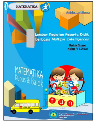
Figure 1. Cover