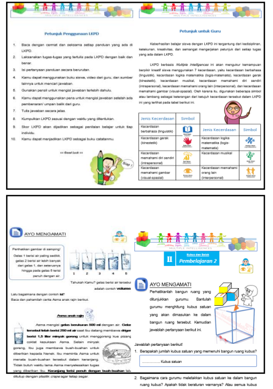
Figure 3. Instructions on using student worksheet

Figure 2. Mapping of core competencies, basic competencies, indicators, and learning objectives