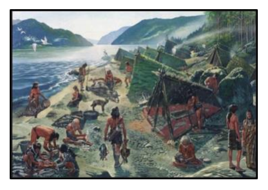
In the Neolithic Age, boats were used to fish

early ships had limited functions, they could move on water. Ships in the Neolithic era were used for hunting and fishing. The oldest canoes discovered by archaeologists were often made from coniferous tree trunks, using simple stone tools (Marwadi, 2011).