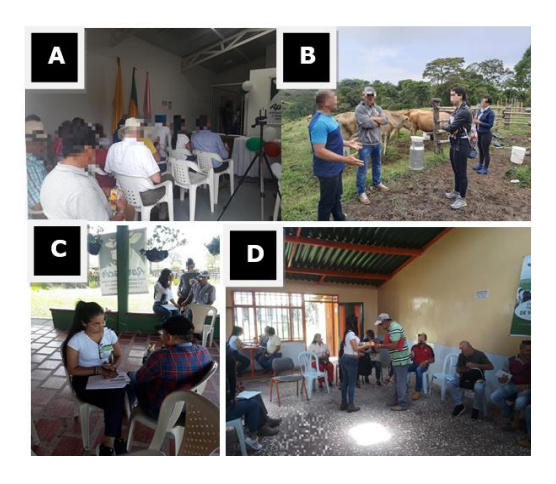
Figure 2. Field trips.

consensus. Immersion in the field made it easier for APROLACIR and ASOPROAGRO associates to consider organizing and associating under the cooperative model, allowing them to carry out effective activities that lead to economic reactivation and improvement of competitiveness.