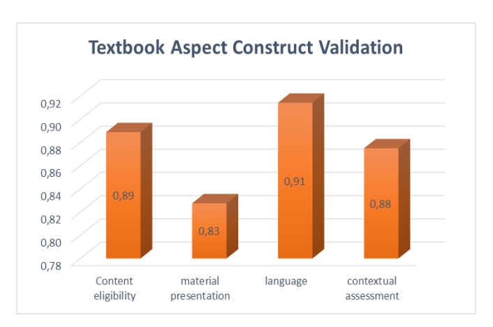
FIGURE 2 . The content validation results from experts

The results of validating the content of teaching materials from experts are divided into two exposures: the main aspects of the composition and sub-indicators of teaching materials. Its constituents' main aspects are the content's appropriateness, presentation of the material, language, and contextual assessment. The details of the four aspects are shown in the following chart: