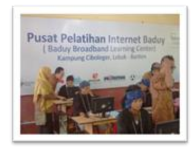
FIGURE 4. The Documentation of youth internet learning activity in outer baduy