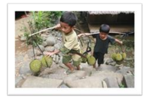
FIGURE 2. children of baduy who obey their parents' orders

The role of the surrounding community, especially from outside Lebak village, in encouraging the Baduy community to be open to technology, and information to exchange good values. From figure 4, we can see that they are learning how to use computer equipment.