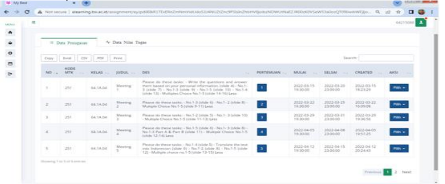
Figure 5. Page display of assignments given by the lecturer on MyBest (example)

Lecturer can share teaching materials through MyBest that will be appeared on students' site. The materials may be in the form of text, video, or presentation slides.