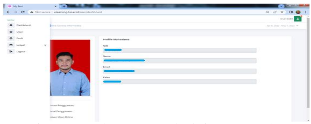
Figure 1. First page which appears when students log into MyBest (example)

As one of the platform in online learning, MyBest has some features which can be used in order to support the process of online teaching and learning. Below are some features and their appearance in students' page: