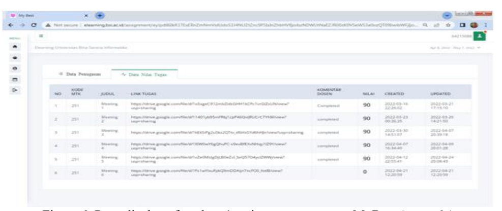
Figure 6. Page display of students' assignment scores on MyBest (example)

Students will get notification every time the lecturer gives assignment through MyBest. They can check the details about it such as the tasks instructions and deadline by clicking the option 'Data Penugasan', submit their works by inputting the link of it that has been saved in their Google drive.