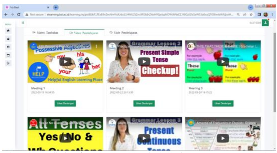
Figure 4. Page display of learning materials uploaded by lecturer on MyBest (example)

Lecturer can share teaching materials through MyBest that will be appeared on students' site. The materials may be in the form of text, video, or presentation slides.